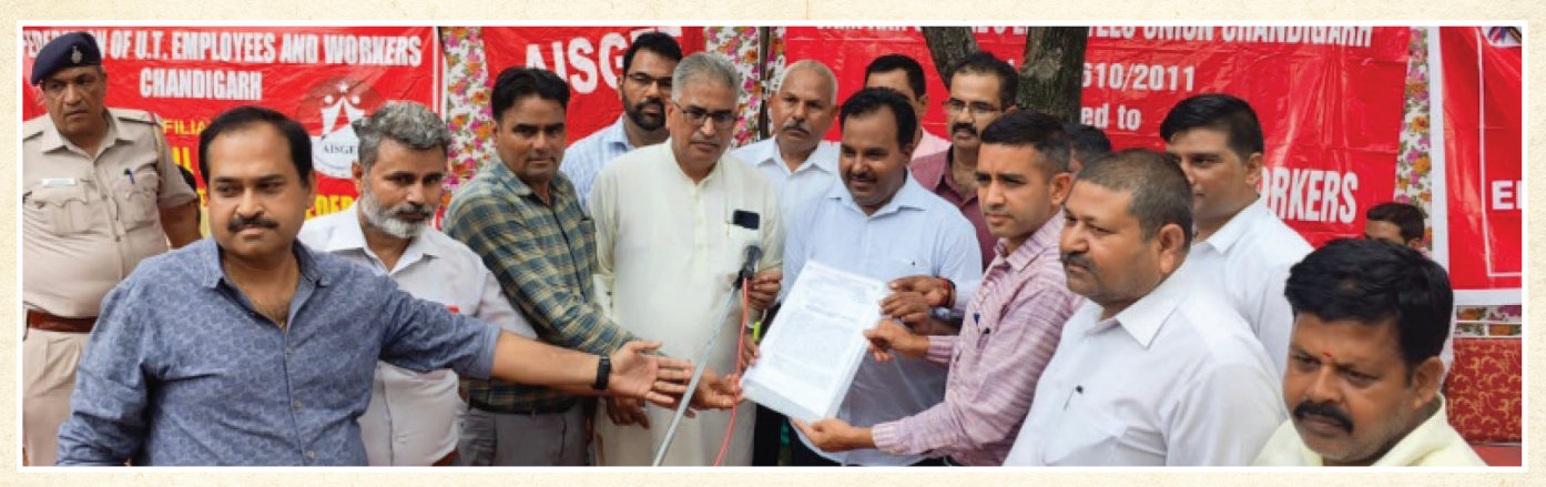
4th July Demand Day